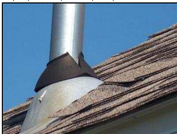
1.2 Picture 1

1.2 Roof penetration boot has failed (cracked or come loose). This condition can cause leaking or rot. Suggest a qualified repair person repair or replace penetration seal.