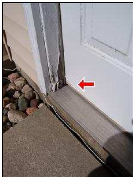
2.1 Picture 1

Dryer vent at exterior of home is stuck open. This can allow vermin and debris to accumulate in dryer vent. This potentially can clog vent causing an unsafe condition.