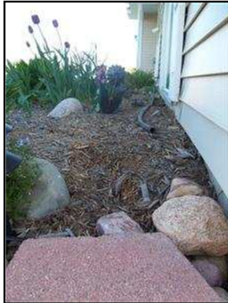
2.4 Picture 1

2.4 The landscape at the front of home may require a trench or drain if water stands or puddles after heavy rain. I am unable to determine due to no rain during inspection period.