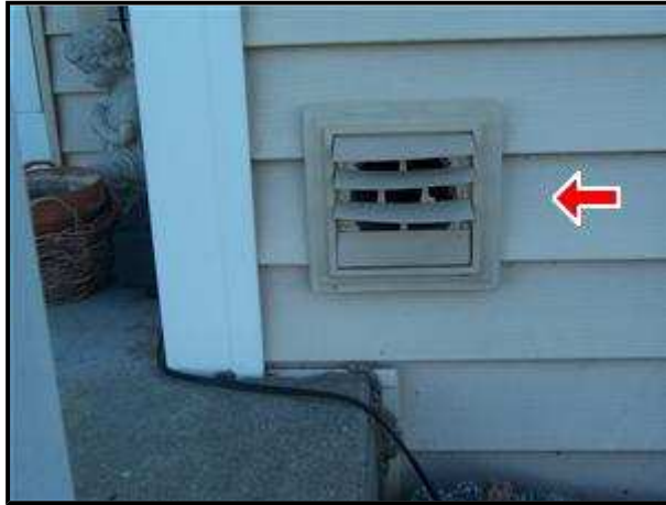
2.1 Picture 3

2.4 The landscape at the front of home may require a trench or drain if water stands or puddles after heavy rain. I am unable to determine due to no rain during inspection period.