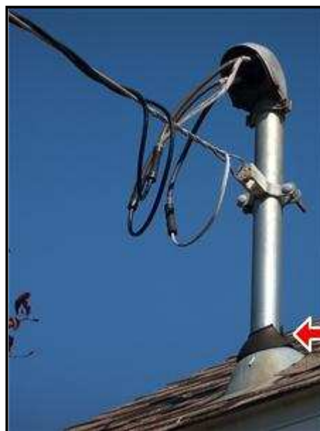
1.2 Picture 2

1.3 Gutters and drain lines are needed or erosion or water intrusion can occur.