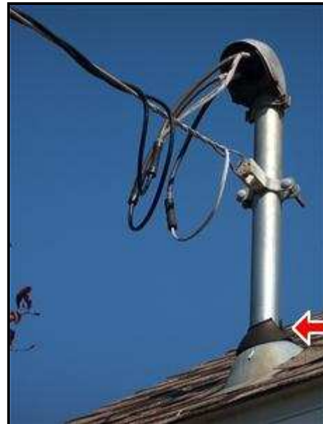
1.2 Picture 2