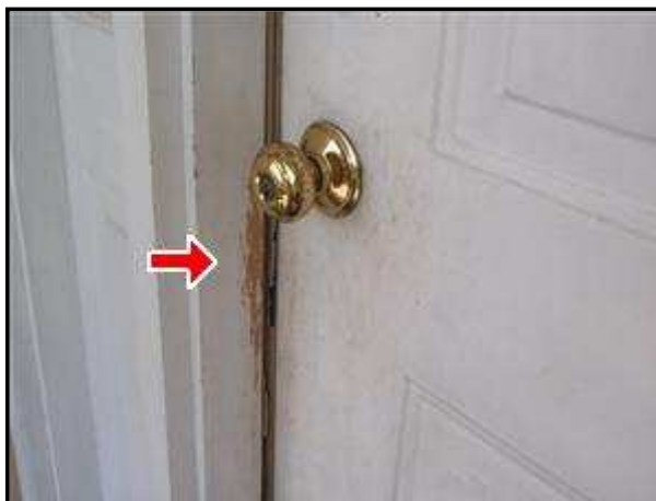
2.1 Picture 2