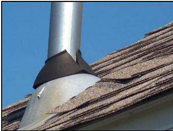
1.2 Picture 1

Roof penetration boot has failed (cracked or come loose). This condition can cause leaking or rot. Suggest a qualified repair person repair or replace penetration seal.